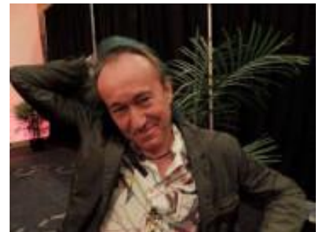
Dr. Patrick Blanc